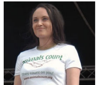
White medium skinny fit T-shirt