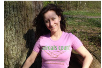
Pink small skinny fit T-shirt