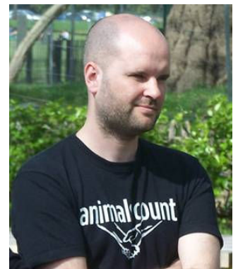
Black medium unisex T-shirt